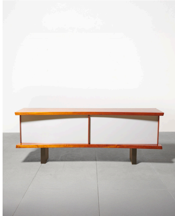
Charlotte PERRIAND (1903-1999)

Table with oval top in stained wood resting on two legs, one in white stone, the other in wood.