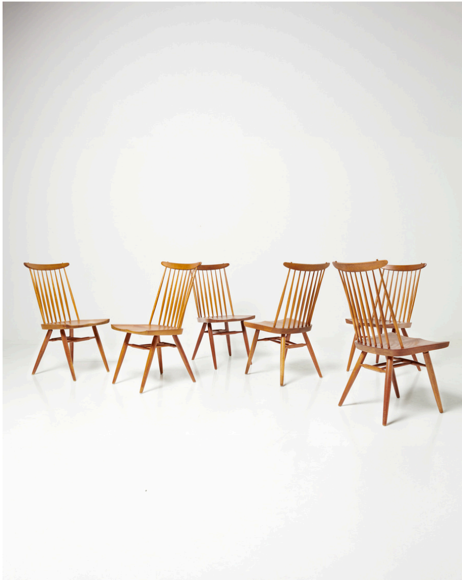
George NAKASHIMA (1905 - 1990)

Jardin des Tuileries, 75001 Paris Booth 01