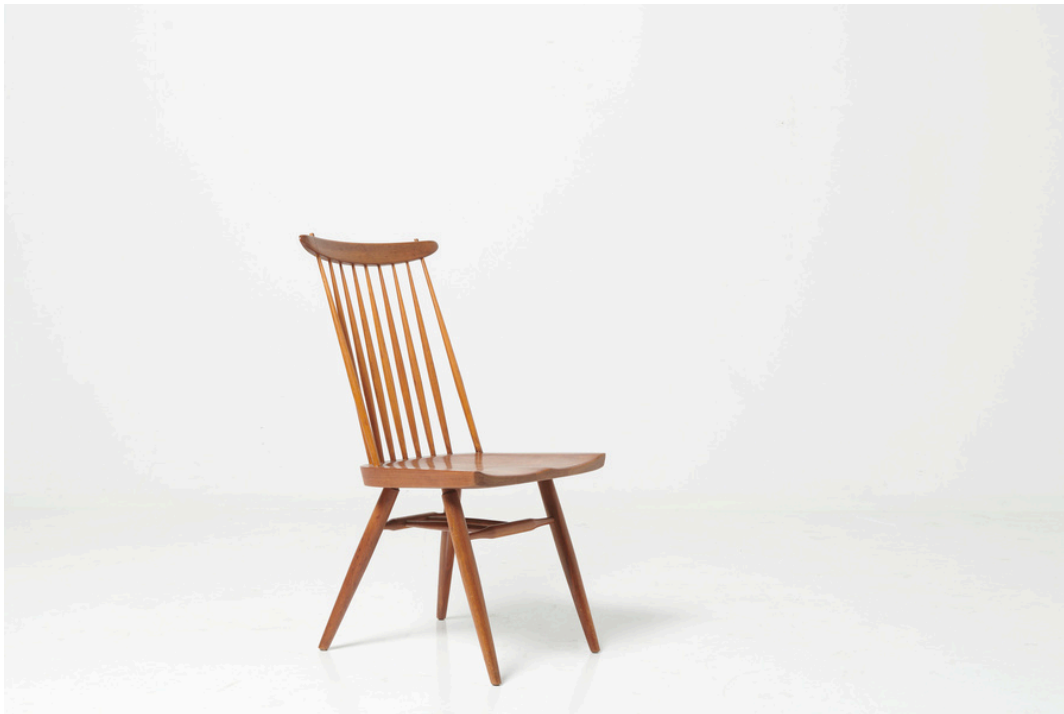
George NAKASHIMA (1905 - 1990)

His chairs, exhibited by Laffanour | Gallerie Downtown Paris, reflect this philosophy. Sculpted with artisanal precision, they combine clean lines with traditional joinery, where structure seamlessly blends with material. The wood, carefully selected for its unique character, becomes a living element that shapes the balance and ergonomics of each seat.