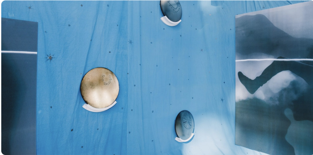
Image: View of Galeria Madragoa stand at Art Basel Paris 2024, with works by Steffani Jemison.