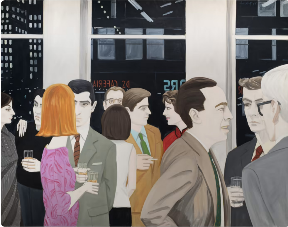
Image: Alex Katz, The Cocktail Party, 1965. © Alex Katz/VAGA at ARS, NY and DACS, London