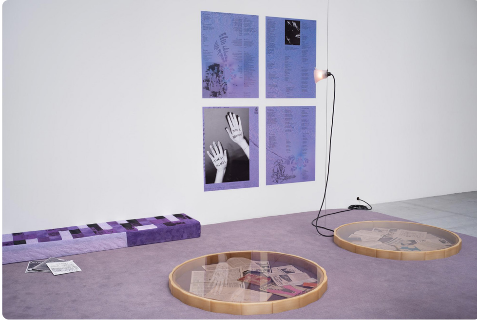
Image: Tania Gheerbrant, Fleurs de l'histoire, 2024, produced with the support of Drac Idf and Palais de Tokyo. Exhibition view, Toucher l'insensé, Palais de Tokyo, cur. François Piron, 2024.