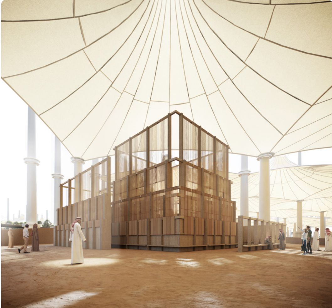
Image: EAST Architecture Studio, Rayyane Tabet and AKT II. © EAST Architecture Studio