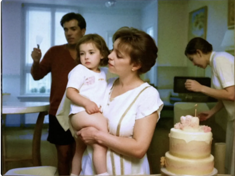
Image: Rony Efrat, Failing Forward, 2024. © Rony Efrat, Le Fresnoy – Studio national des arts contemporains, 2024