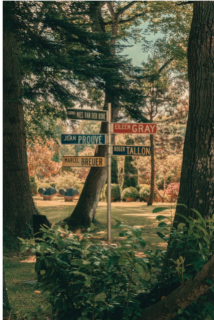
A signpost sculpture in the garden.