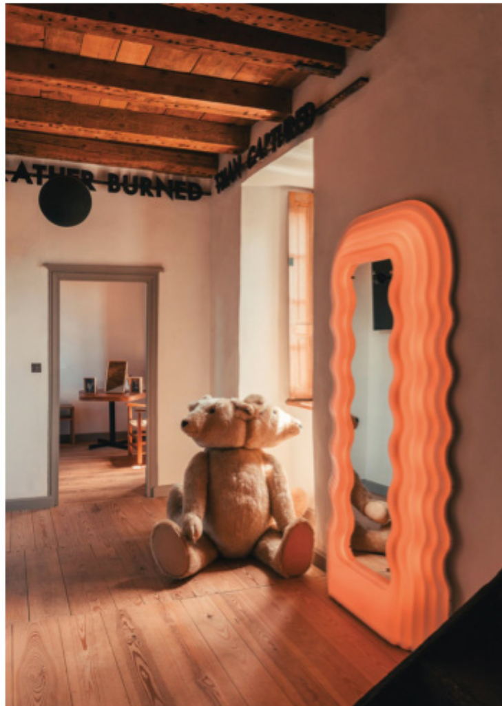
In a hallway on the third floor, Ettore Sottsass's Ultrafragola mirror stands alongside a stuffed bear sculpture by Charlemagne Palestine.