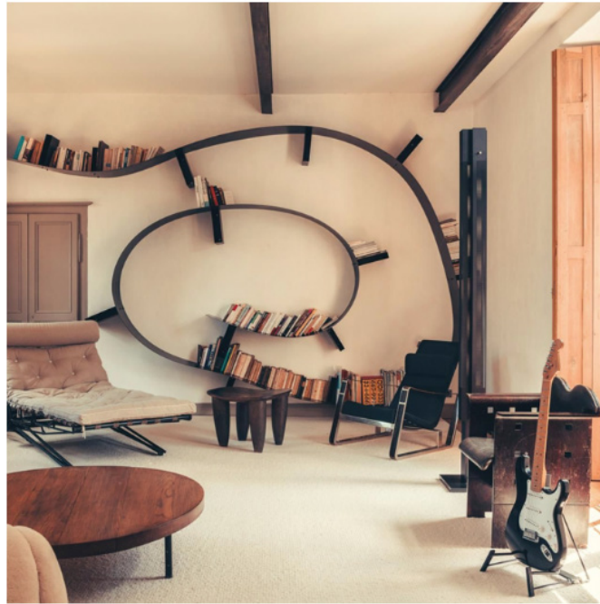
From left: Ron Arad's snail-like steel bookcase, an Osvaldo Borsani chaise (left) and a Jean Prouvé chair.