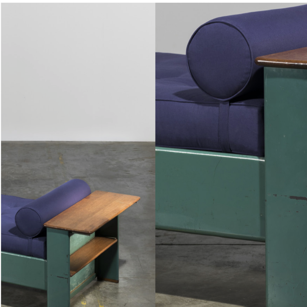
Jean Prouvé (1901-1984), « Fabert » bed, Ca. 1935

What Laffanour Galerie Downtown selected for Design Miami.