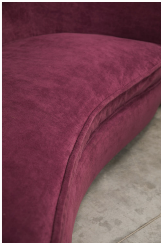
Curved sofa re-upholstered with red velvet, 5 cylindrical oak legs H. 28,7 x L. 92,9 x W. 48 in.

Design dealer François Laffanour will bring iconic pieces of furniture by famous French designers to this year's TEFAF.