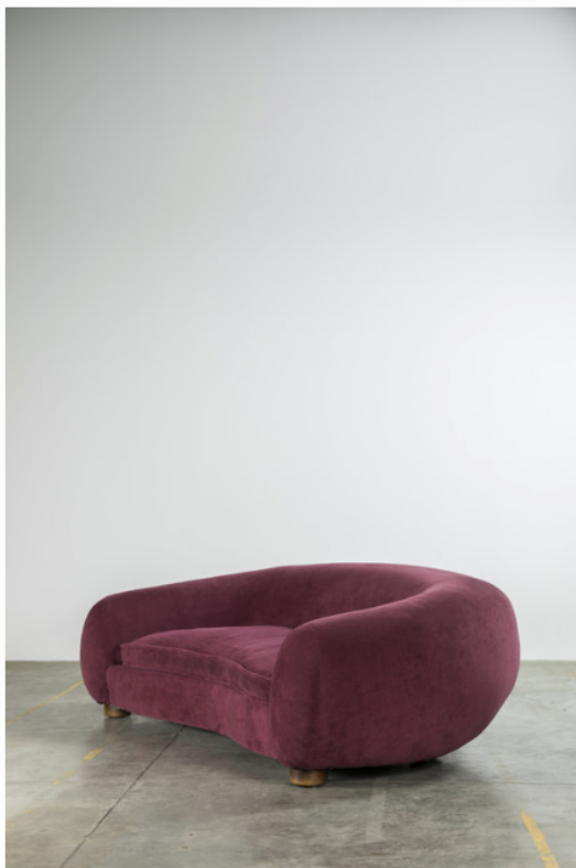
Jean Royère (1902-1981) "Polar bear" sofa, Ca. 1947